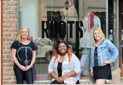
My Roots February's First Place Window Contest Winner!