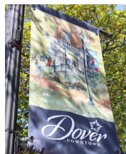
75 Art Banners