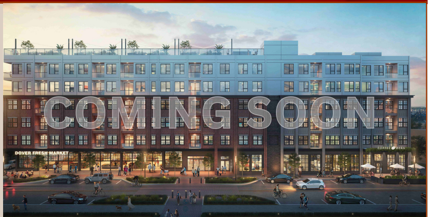
Conceptual drawing of mixed-use redevelopment at 120 S. Governors Ave.

Amidst jackhammers, excavators, bucket trucks, bulldozers, street sweepers, and the like, they will also see a reduction in commercial building vacancy, increased foot traffic, road infrastructure and transportation improvements, including a parking structure, as well as preparations for 200 new residents (toward goal of 2000) in multi-story buildings, alternative modes of getting around the city, and color and vibrancy in the district.